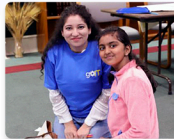
Meet Industry Experts