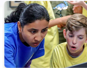
Provide a Safe Space to Innovate